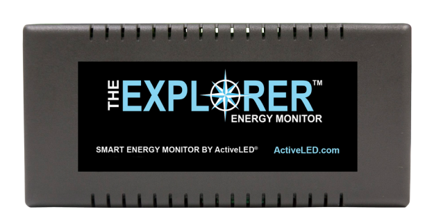
The Explorer Energy Monitor

The Explorer Energy Monitor is available in both commercial and residential versions.